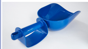
Ergonomic NSF approved sanitary ice scoop included