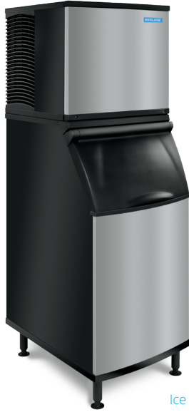
Koolaire KT-0420 Ice Kube Machine on K420 Bin

Koolaire by Manitowoc ice machines are designed, developed and tested by Manitowoc engineers to provide great ice production, energy efficiency and reliable service at an affordable price.