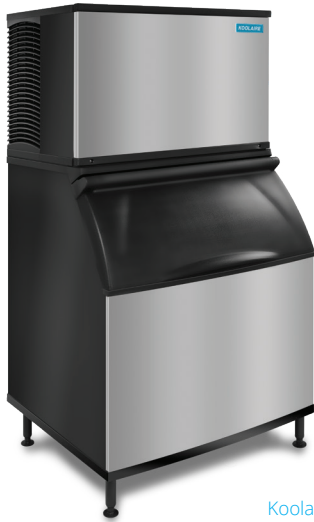
Koolaire KT-0400 Ice Kube Machine on K400 Bin

Koolaire by Manitowoc ice machines are designed, developed and tested by Manitowoc engineers to provide great ice production, energy efficiency and reliable service at an affordable price.