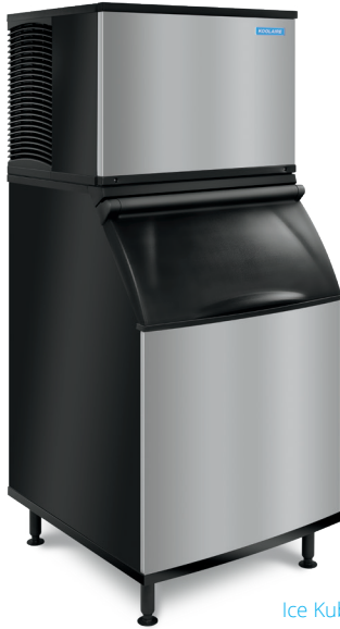
Koolaire KT-0700 Ice Kube Machine on K570 Bin

Koolaire by Manitowoc ice machines are designed, developed and tested by Manitowoc engineers to provide great ice production, energy efficiency and reliable service at an affordable price.